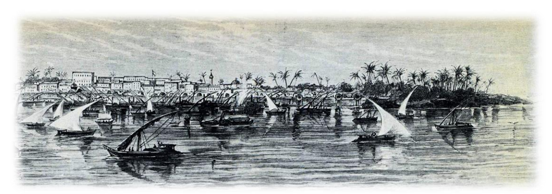
Khartoum - Colonel Colborne, 1880

For although the British finally carried of the victory, this image was what remained the symbol for the futility of this war, for the defeat at the end of the campaign: the destruction of the orderly and sober British infantry square by the chaotic and wild force of the Mahdists.