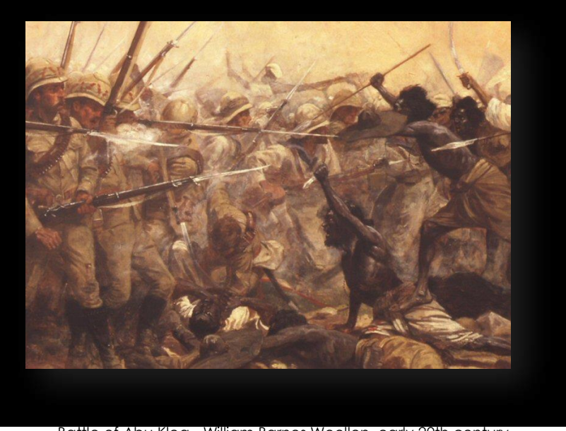
Battle of Abu Klea - William Barnes Woollen, early 20th century

Compared to other battles of the Mahdist War, the death toll for the British troops was relatively small: out of 1,400 men, 71 men - among them 11 officers - were killed, 64 wounded; three soldiers were missing in action. An estimated 14,000 Mahdists fought on the other side, out of which roughly 3,000 were actively involved in battle with a death toll of about 50%.