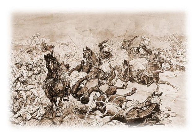
Battle of El-Teb - Le Monde Illustré, 1844

3,342 men infantry, gunners and sappers and 864 men cavalry faced in this second battle an estimated 15,000 men of the Mahdi; 5 British officers and 24 soldiers lost their lives, 17 officers and 142 soldiers were wounded. On the side of the Mahdi, some 2,500 were killed; the number of wounded is unknown.