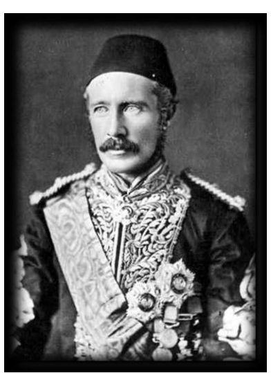
General Charles Gordon, ca. 1883